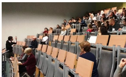
In the photo participants of the discussion panel (23.10.2018)