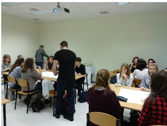
In the photo youth during World Café workshops (9.11.2018)